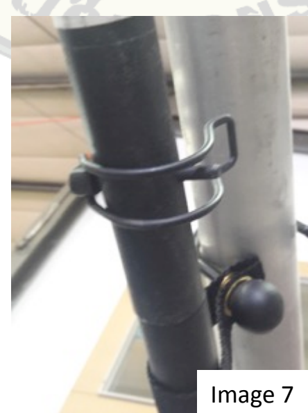
Step 5: Using the Spring Loaded Pins; Lock in each PVC Pipe to the Next one in the system (Image 7)