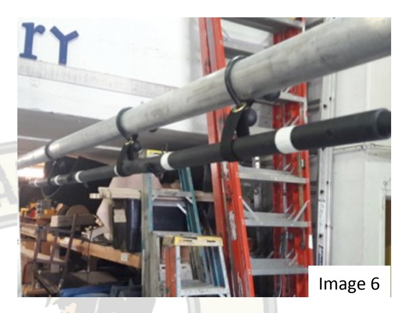
Step 4: Slide Sections of PVC Pipe through the chain loops, and Sleeve them to each other to create an under hanging Batten from the Original Pipe (Image 6)