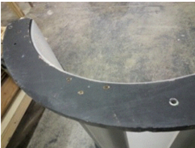
Top View (with 3 threaded holes; bottom holes have no threading)

You Want What? Productions, Inc. 2879 S Tejon St. Englewood CO 80110 T 303-744-6465