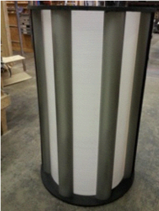
Front View (4' tall, semi circle)