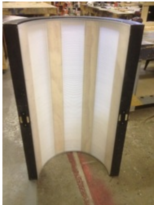
Back View (note the jack connection plates)